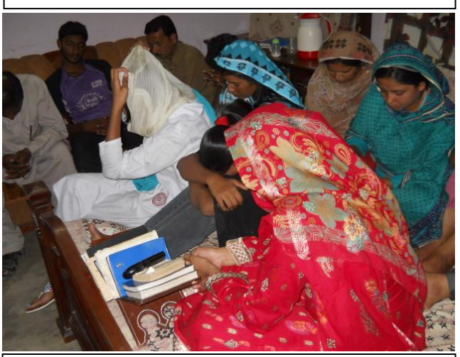
Christians hungry for God meeting at a house fellowship meeting in Pakistan